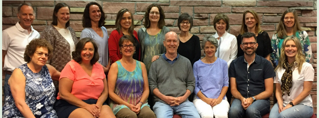
TNE Board, Faculty and Staff at the October 2019 Strategic Planning Retreat in Boulder, CO

THE NARRATIVE ENNEAGRAM (TNE) is an educational nonprofit dedicated to transforming lives and creating a more compassionate world. Our mission is to advance human consciousness through our pioneering Narrative Enneagram curriculum, which integrates psychological, spiritual and somatic practice.